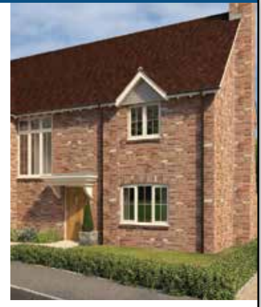
CREESONS PLUMBING & HEATING 59-63 HOPES LANE RAMSGATE, CT12 6UW

Our highly skilled, fully qualified engineers have a wealth of experience and knowledge. Our engineers specialise in installations for new build housing.