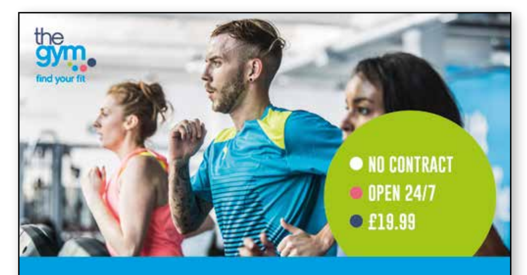
Join THANET at thegymgroup.com Terms and conditions apply. See www.thegymgroup.com for details