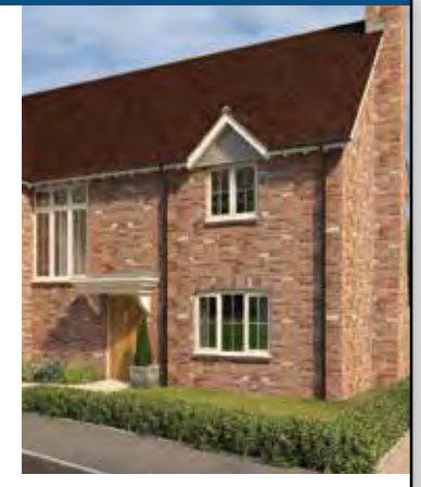
CREESONS PLUMBING & HEATING 59-63 HOPES LANE RAMSGATE, CT12 6UW

Our highly skilled, fully qualified engineers have a wealth of experience and knowledge. Our engineers specialise in installations for new build housing.