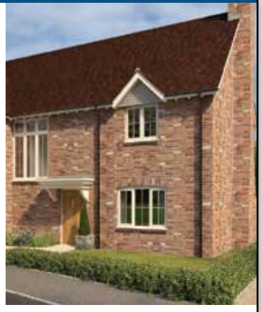
CREESONS PLUMBING & HEATING 59-63 HOPES LANE RAMSGATE, CT12 6UW

Our highly skilled, fully qualified engineers have a wealth of experience and knowledge. Our engineers specialise in installations for new build housing.