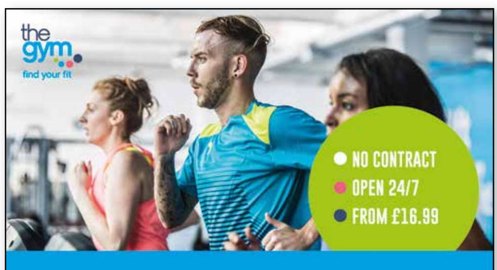
Join THANET at thegymgroup.com

erns and conditions apply. See www.thegymgroup.com for detail